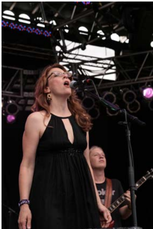
Soul Stew Revival

Sure, the line up was good -- Phil Lesh and Friends, Widespread Panic, Gov't Mule, Michael Franti & Spearhead, Dark Star Orchestra, Medeski, Scofield, Martin and Wood, Susan Tedeschi, Derek Trucks and Soul Stew Revival, Avett Brothers, Mike Gordon, Grace Potter & the Nocturnals, Tea Leaf Green, Railroad Earth, The Bridge, Pnuma Trio and much more. But what was most appealing after dealing with too many conflicting sets and choosing one act over another and/or catching samplings of as many acts as possible, All Good's two stage set up and no overlapping sets provided a chance to dive in the deep end of the sonic pool.