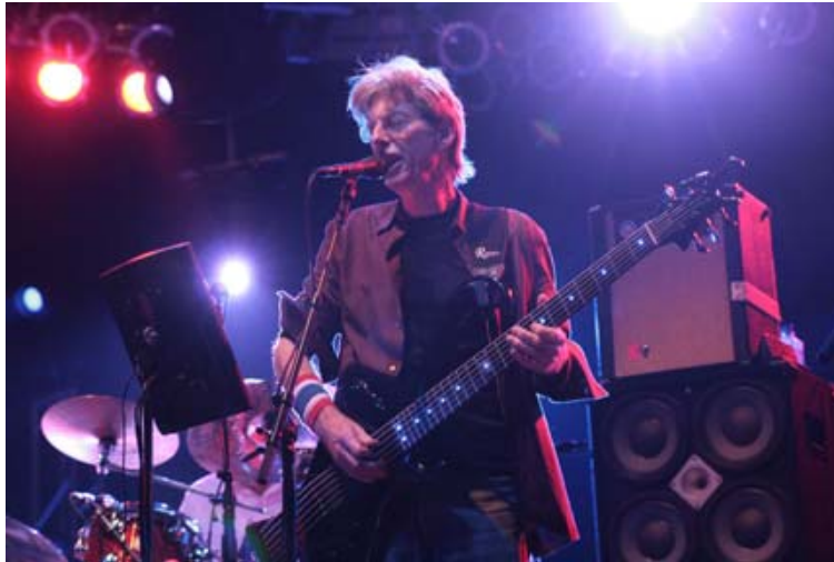
Phil Lesh at All Good

During a summer where I've been fortunate enough to attend Bonnaroo and Rothbury, my run of luck continued with an opportunity to attend this year's All Good Festival at Marvin's Mountaintop in Masontown, West Virginia.